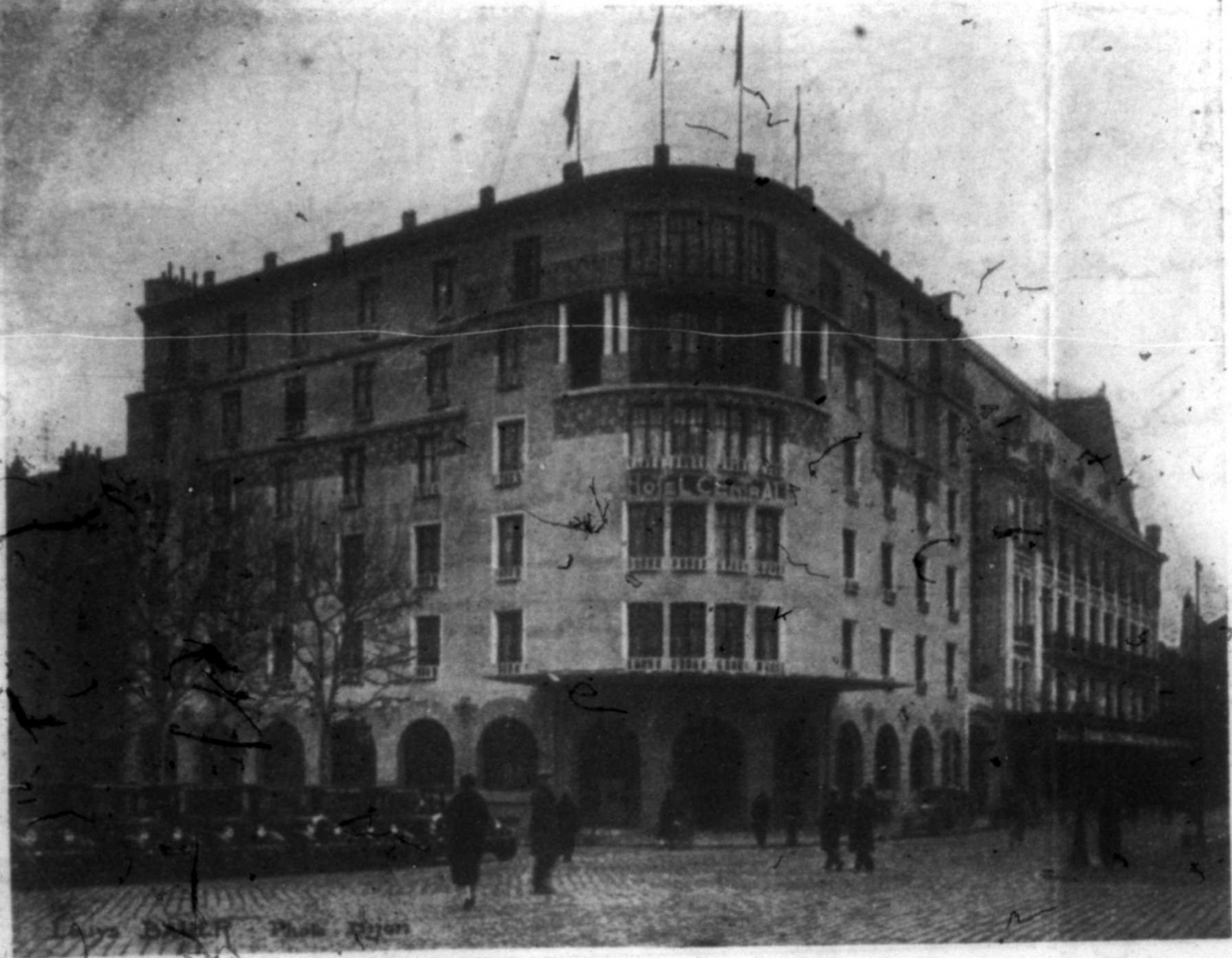
Lays B. & Co. - Photo - N.Y.