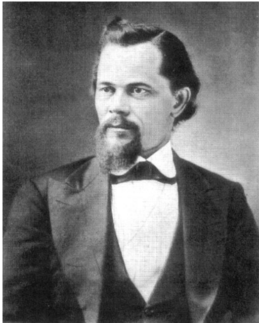
Figure 1. Paschal Beverly Randolph.

Today Randolph is best known as America’s foremost exponent of magical eroticism or affectional alchemy. In sexual love Randolph saw nothing less than “the greatest hope for the regeneration of the world, the key to personal fulfillment as well as social transformation and the basis of a non-repressive civilization” (Rosemont: xv). In the course of his wanderings through Europe, the Middle East, and Asia, Randolph encountered a wide variety of esoteric traditions, which included not