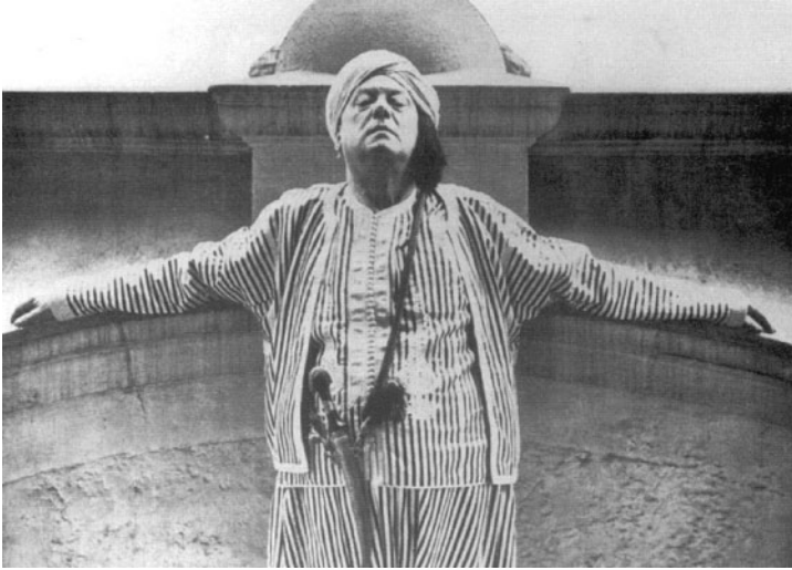
Figure 2. Aleister Crowley dressed as an Oriental sage, in publicity photos to attract students.

Christian morality, he would later turn to the occult arts and to extremes of sexual excess. Educated at Trinity College in Cambridge, Crowley inherited a large amount of money while still young and was free for many years to pursue his passions of poetry, mountain climbing, and the occult arts. While still at Trinity, he would also adopt the name “Aleister” (an homage to the hero of Shelley’s poem “Alastor, the Spirit of Solitude”) and also publish his first book of poetry and his infamous erotic collection, White Stains .