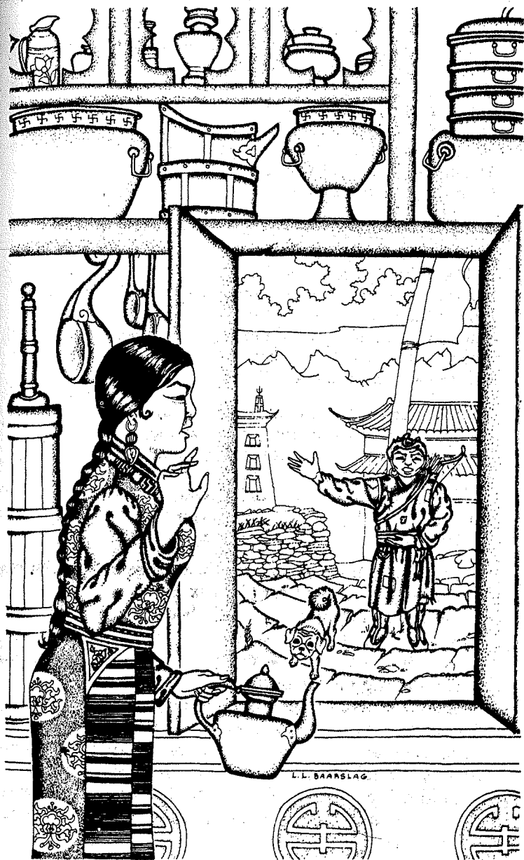
'A moon-faced beggar leaning against the prayer-flag pole. . . .'