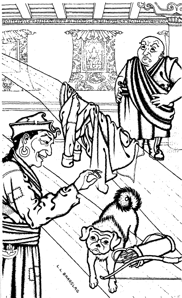
'The Lama hung his bow and arrows, and his dog, on a sunbeam.'